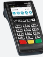
Ingenico Desk 3500