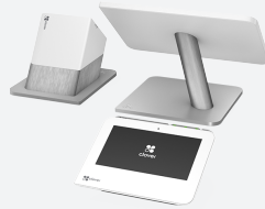
Clover Duo Station